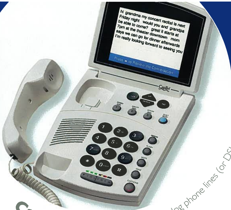
CapTel 800 – for use with analog phone lines (or DSL with filter)